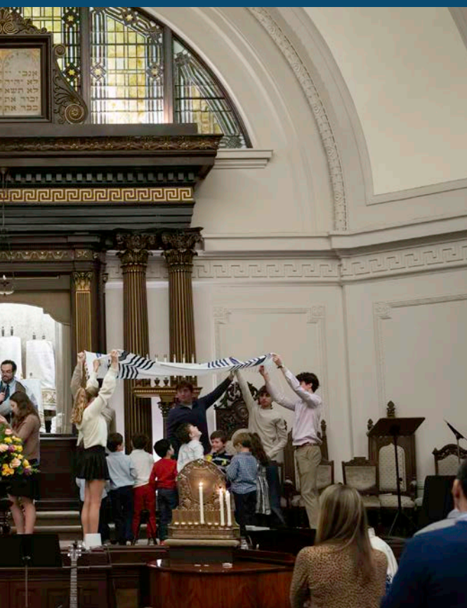
Join us for our Chanukah Celebration and Yamim Yafim Consecration on Friday Evening, December 13!

Light the Shamash - the helper candle - first using it to kindle the rest of the Hanukkah lights; say or sing the blessings below: