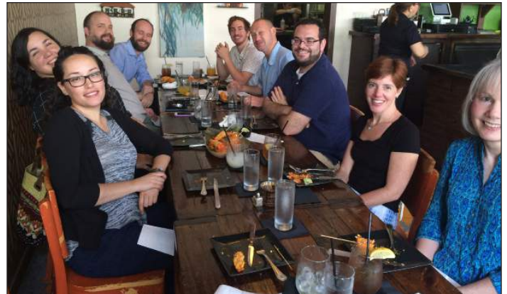
Staff gathering in October 2015.